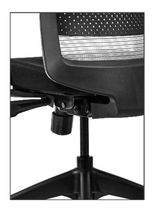
synchro mechanism with tension adjust