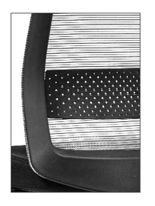
adjustable lumbar support