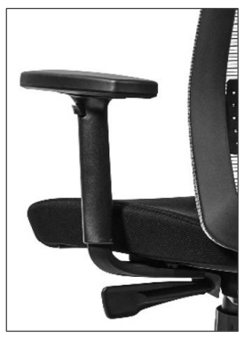
height adjustable arms