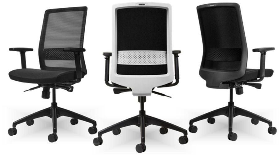
black/grey mesh back, white/black mesh back, black mesh back, black seat and black base stocked for fast delivery

The S30 is a multi adjustable task chair with a breathable elastomer mesh back. This ergonomically designed chair offers as standard a synchronised mechanism for simultaneous adjustment, height adjustable arms and adjustable lumbar support.