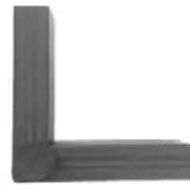
RAW STEEL (smooth satin)