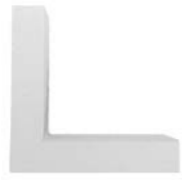
WHITE (textured matt)