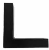
BLACK (smooth satin)