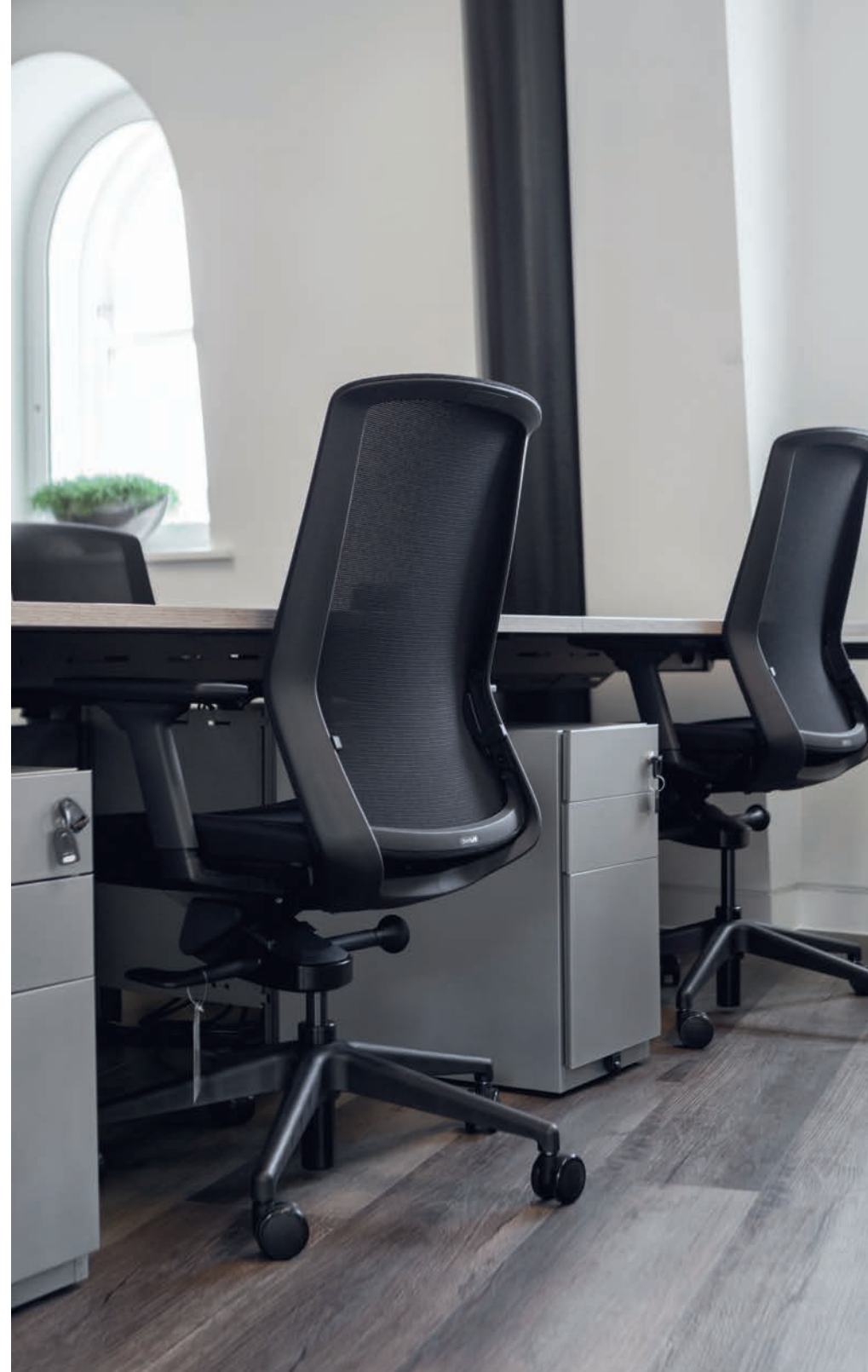
J1 TASK CHAIR