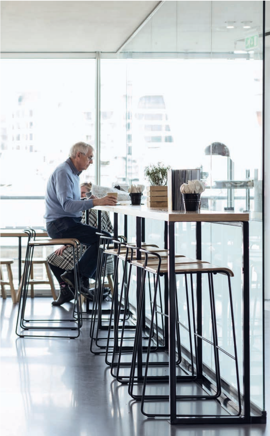
TRANSIT HIGH STOOL