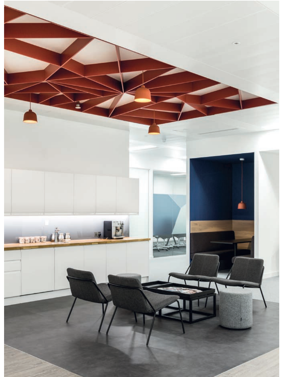
— SLING LOUNGE