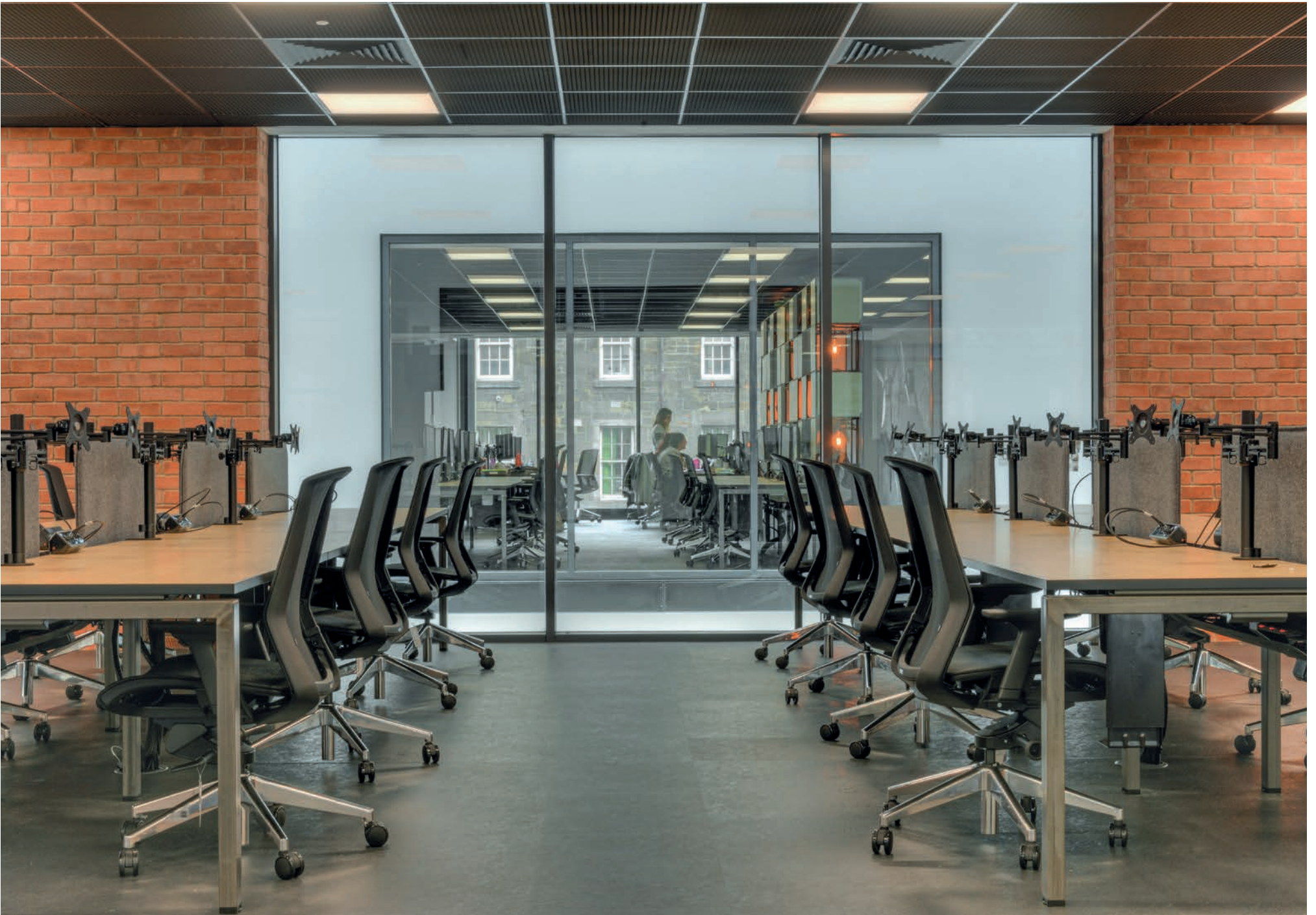
J15 TASK CHAIR