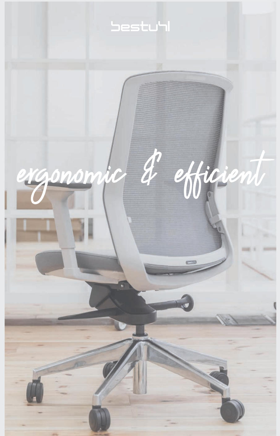
J1 TASK CHAIR