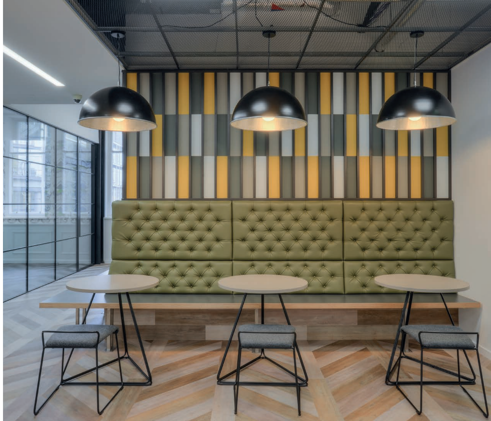
— DELTA TABLE AND TRANSIT LOW STOOL

— Clean, light, elegant designs that deliver functionality and simplicity — this is a range of contemporary furniture designed by a team of international product designers without compromise. Perfect for simple spaces that get used day in and day out.