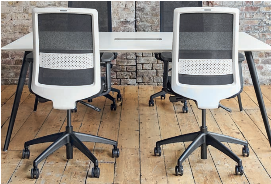
S30 TASK CHAIR

Their expertise in production ranges from procurement of the highest quality materials through to the efficiency of their manufacturing process. Components are produced in state of the art facilities for a perfect quality control with minimal carbon footprint.