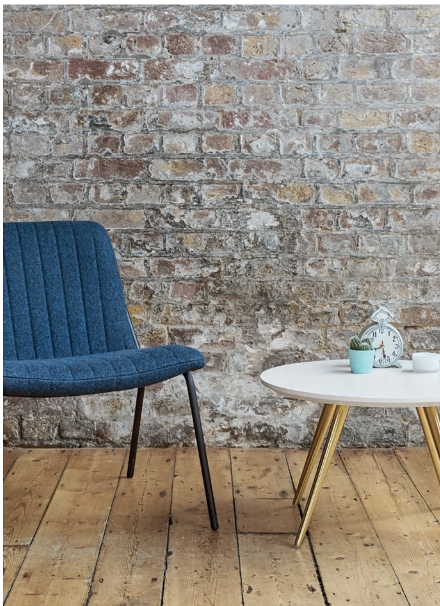
— SLING LOUNGE AND AIR COFFEE TABLE