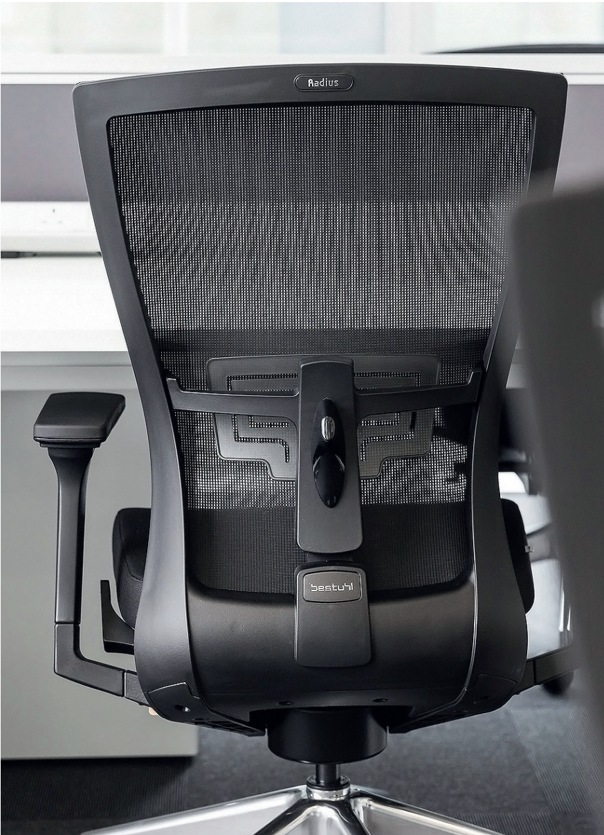
RADIUS TASK CHAIR