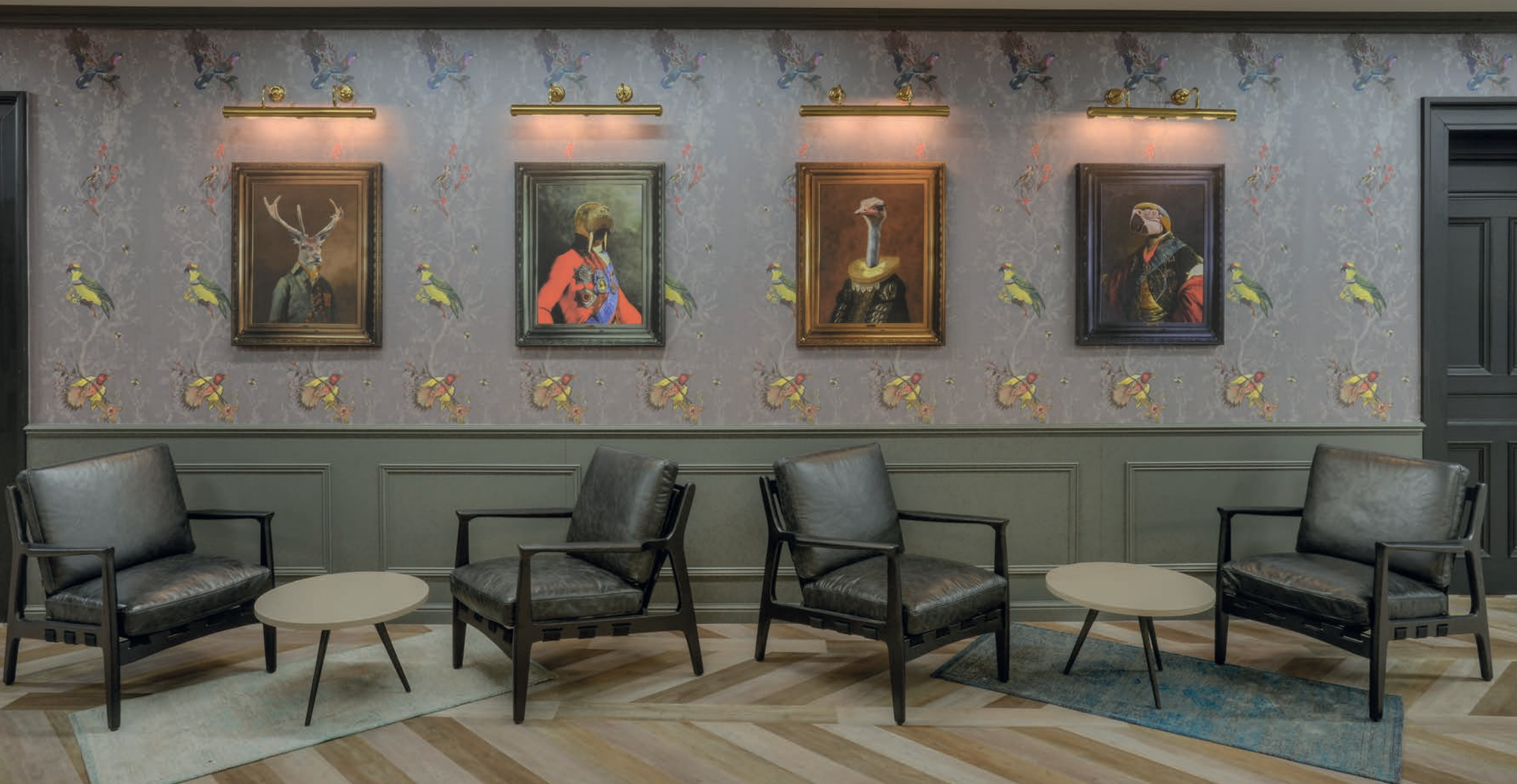
— AT EASE