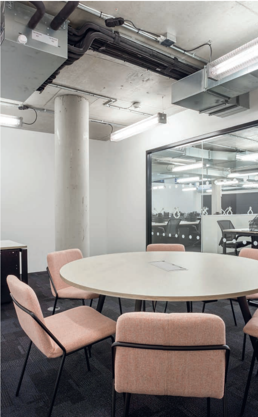
AIR TABLE AND SLING CHAIR