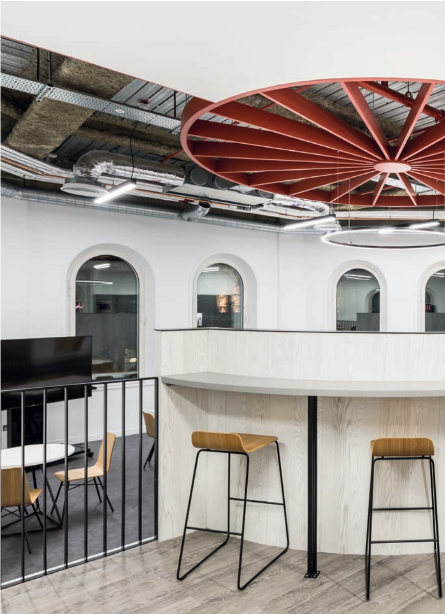
— LOLLI STOOL / CHAIR AND DELTA TABLE