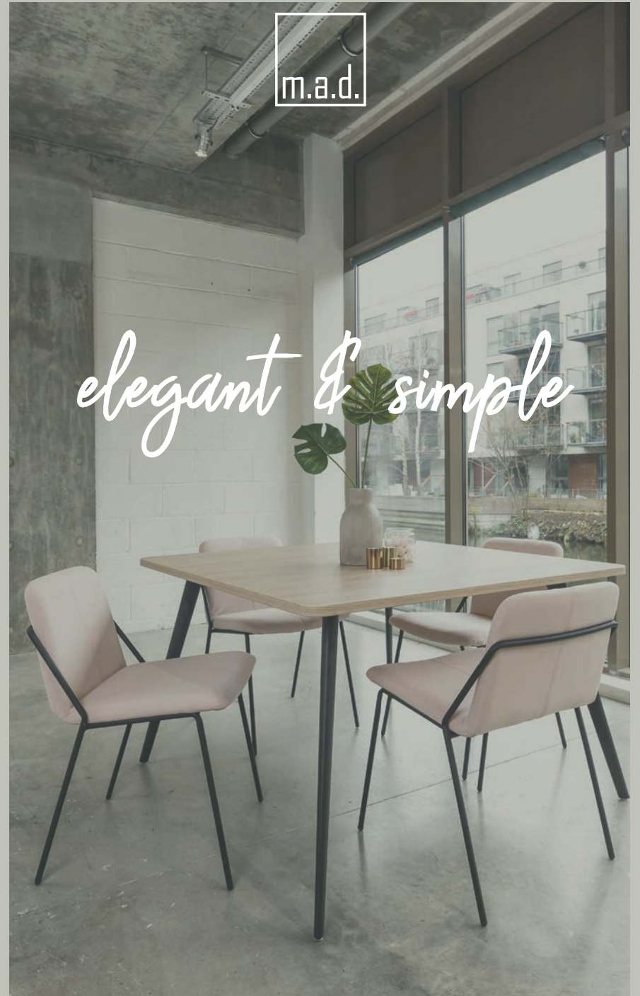
AIR TABLE AND SLING CHAIR