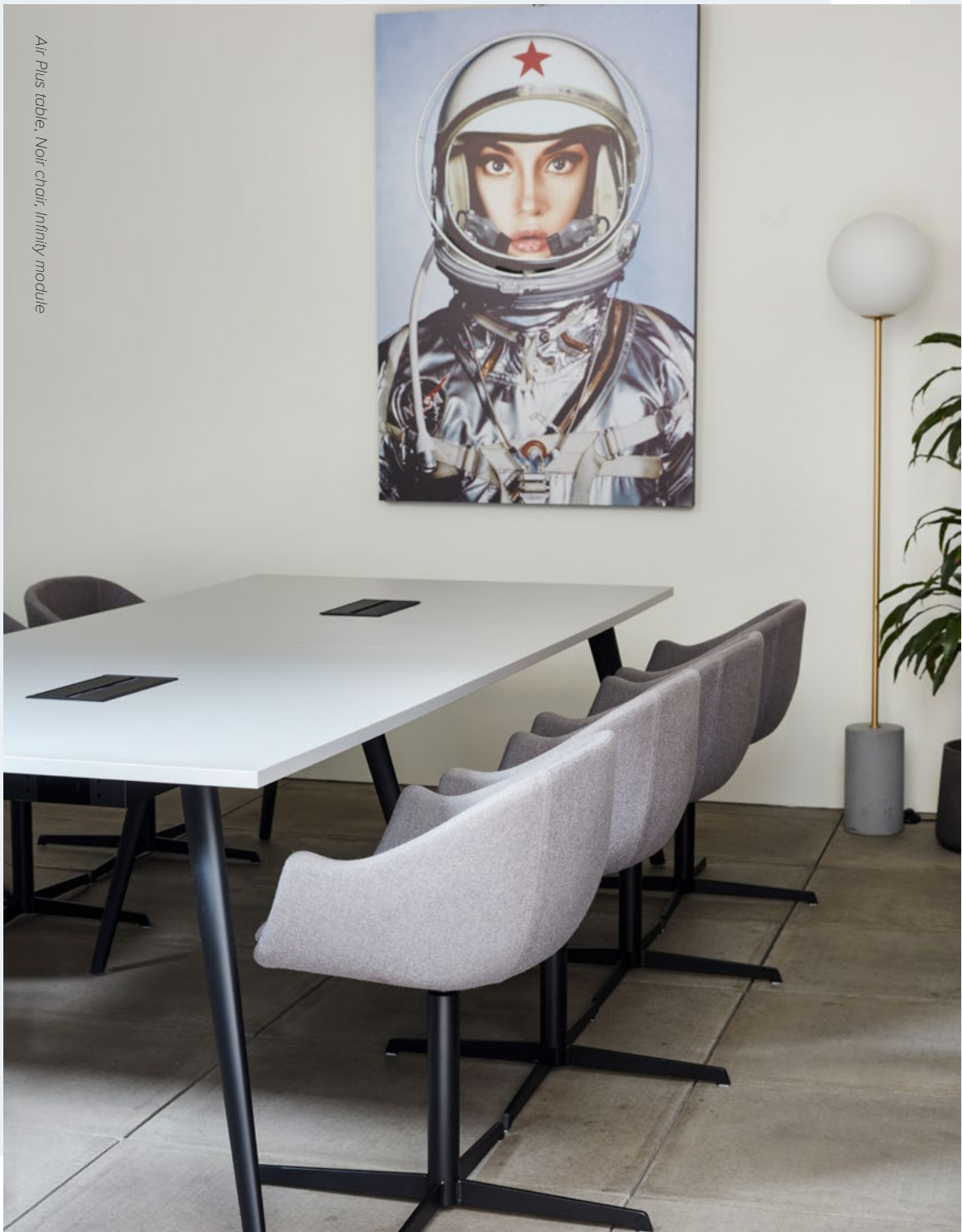
Air Plus table, Noir chair, Infinity module

Having dedicated meeting spaces for people to get together boosts productivity - you can't beat sitting around a table to get new ideas sparking, priorities set and decisions made.