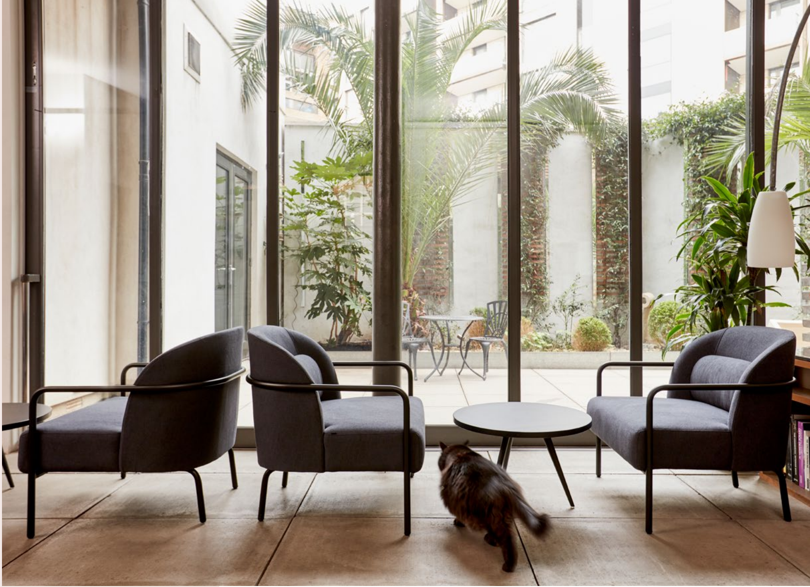
Circa armchair, Air Coffee table