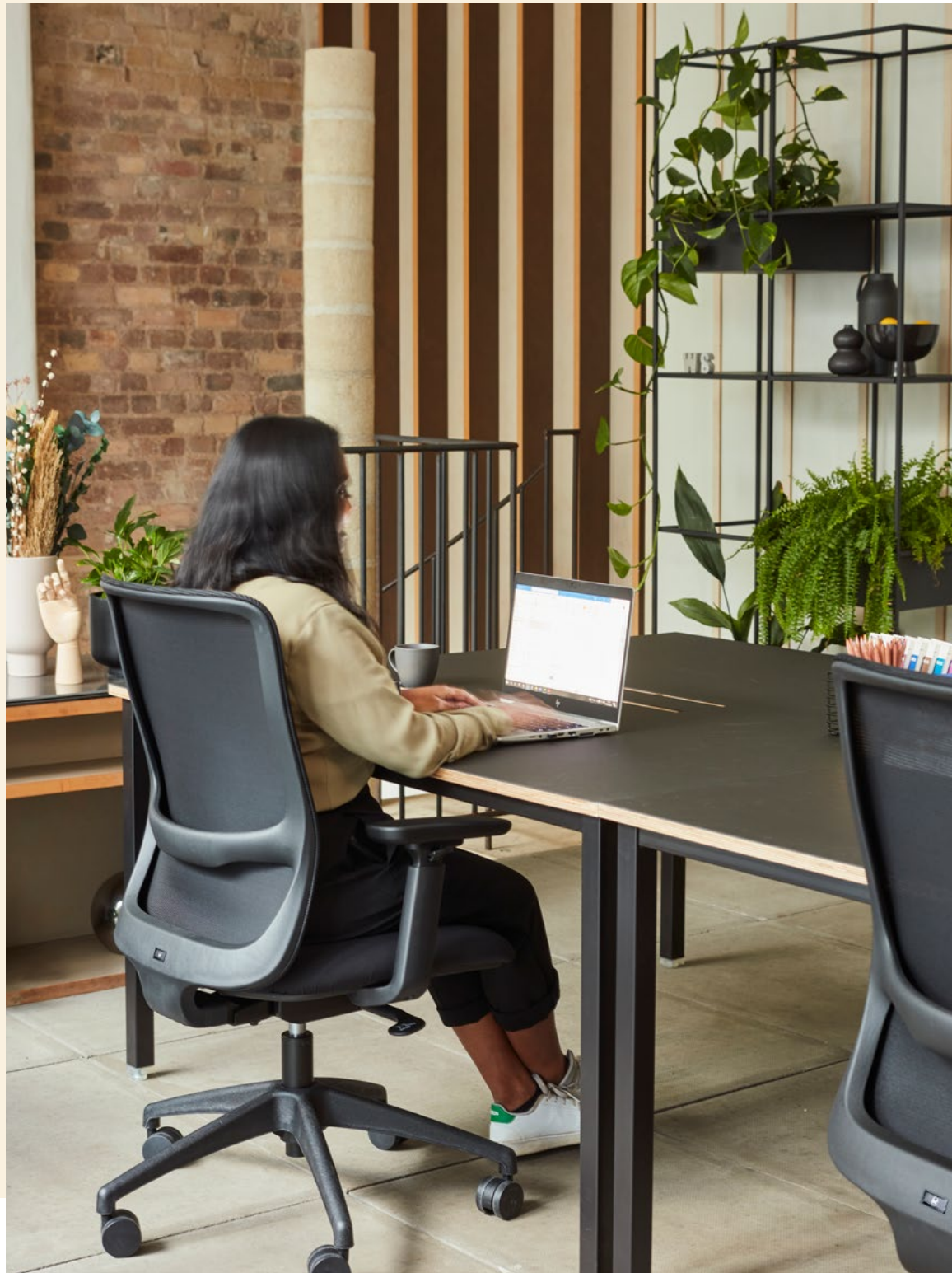
L21 chair, Co.Stories desk

The open workspace remains a centre point where we settle for the day or touch down for a few hours. It gives the set space and mental structure to concentrate on our to-do but also allows for quick conversations to boost agility and innovation.