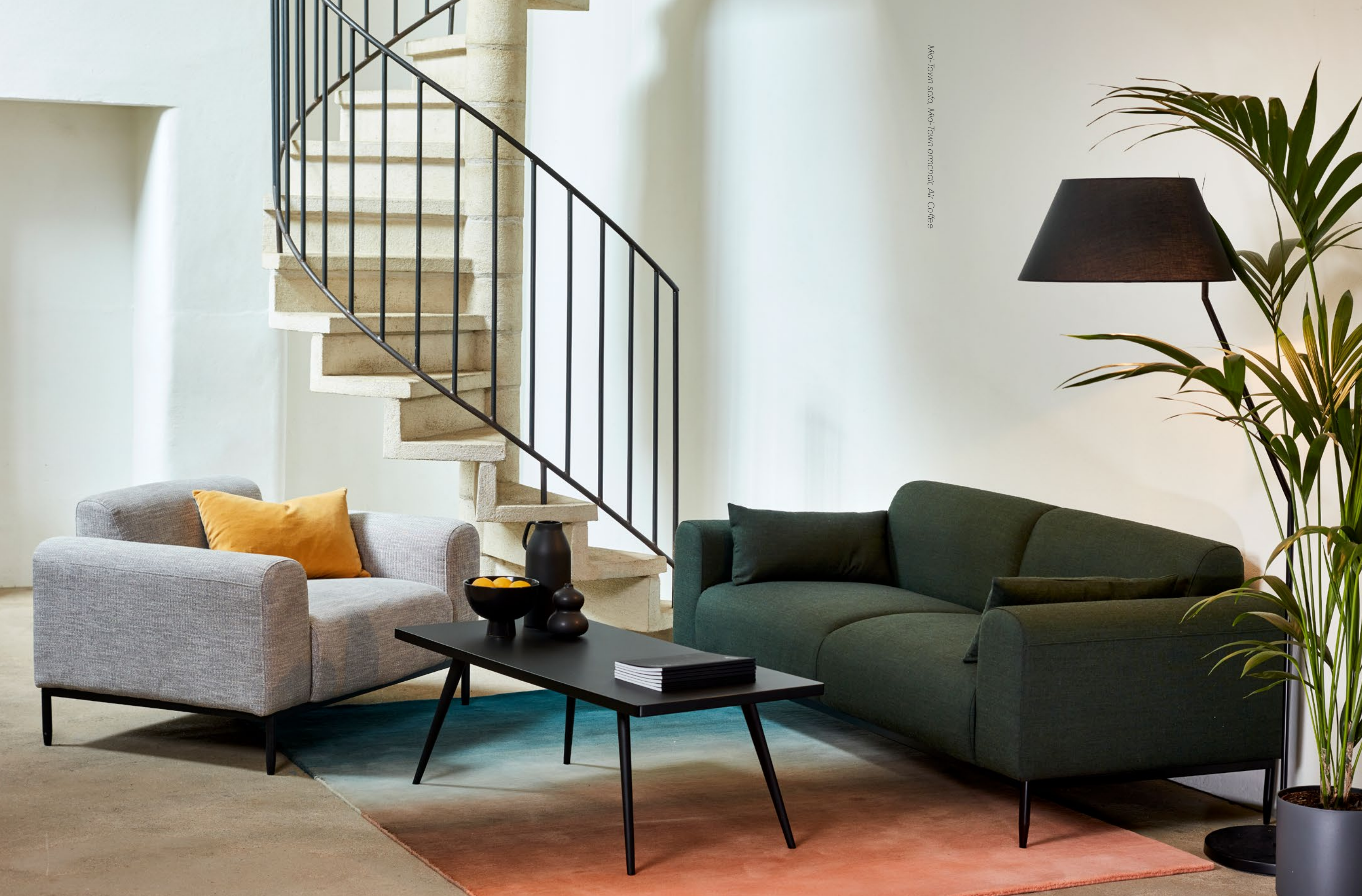
Mid-Town sofa, Mid-Town armchair, Air Coffee