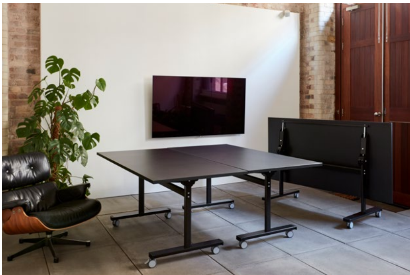
Hybrid furniture to work around the activities and teams need, and not the other way around.