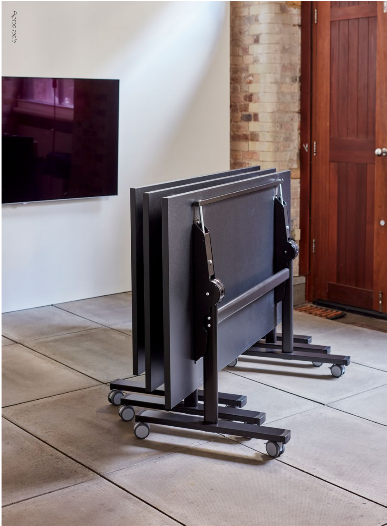
Flip top table