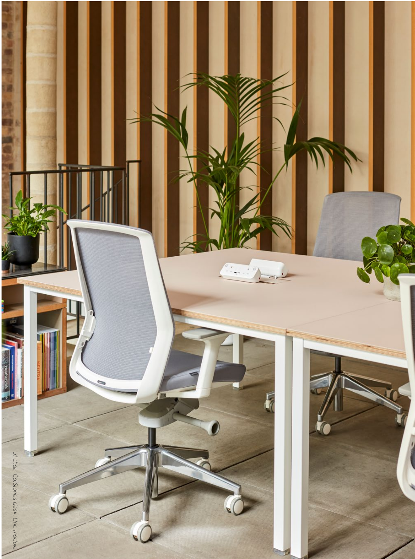
Ji chair, Co.Stories desk, Uno module