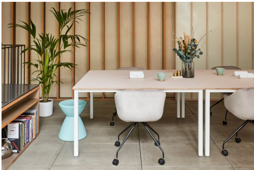
Noir chair, Polo stool

Ergonomic, efficient and effective, Workstories offers a range of highly engineered task and meeting chairs.