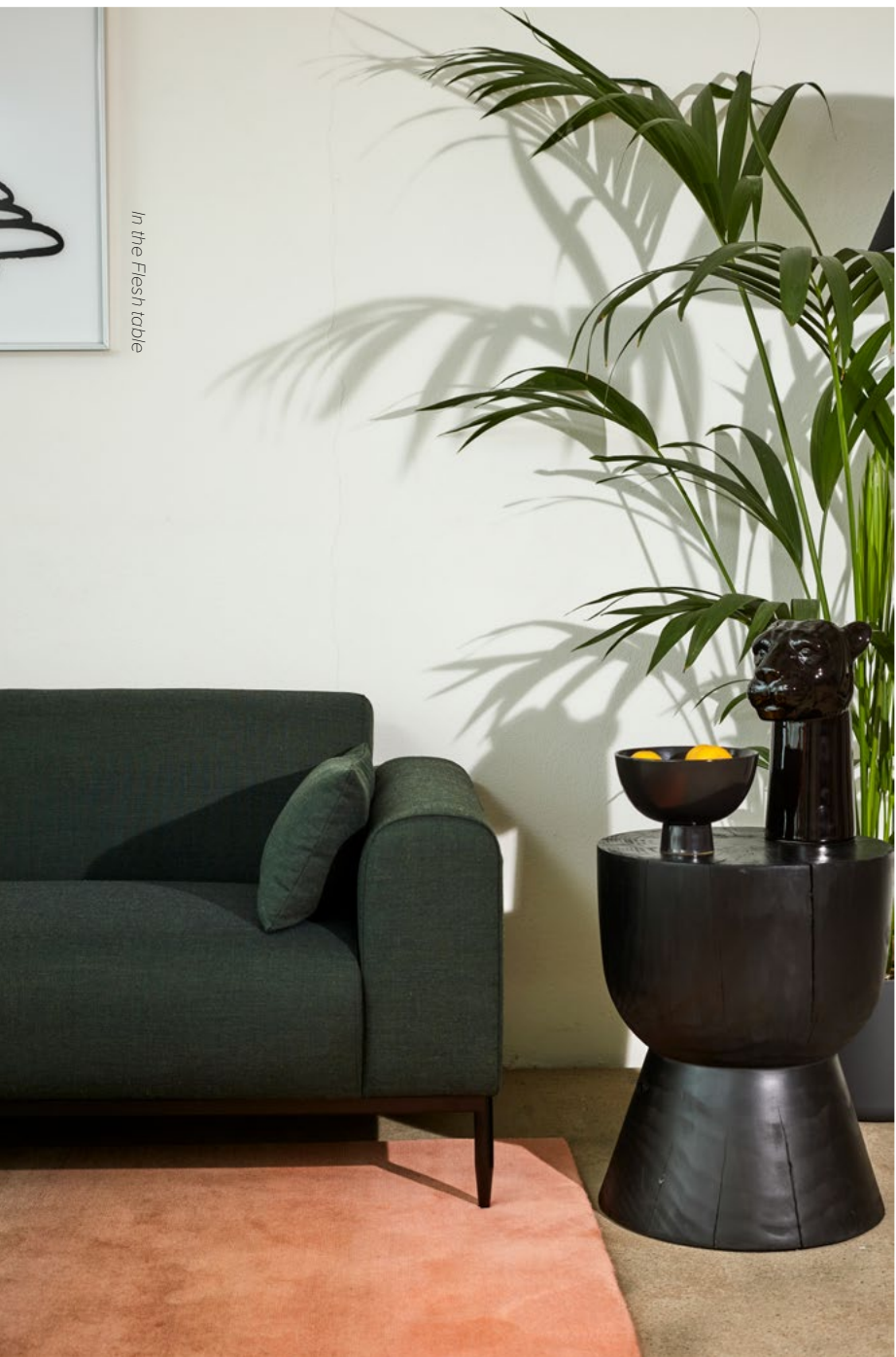
In the Flesh table