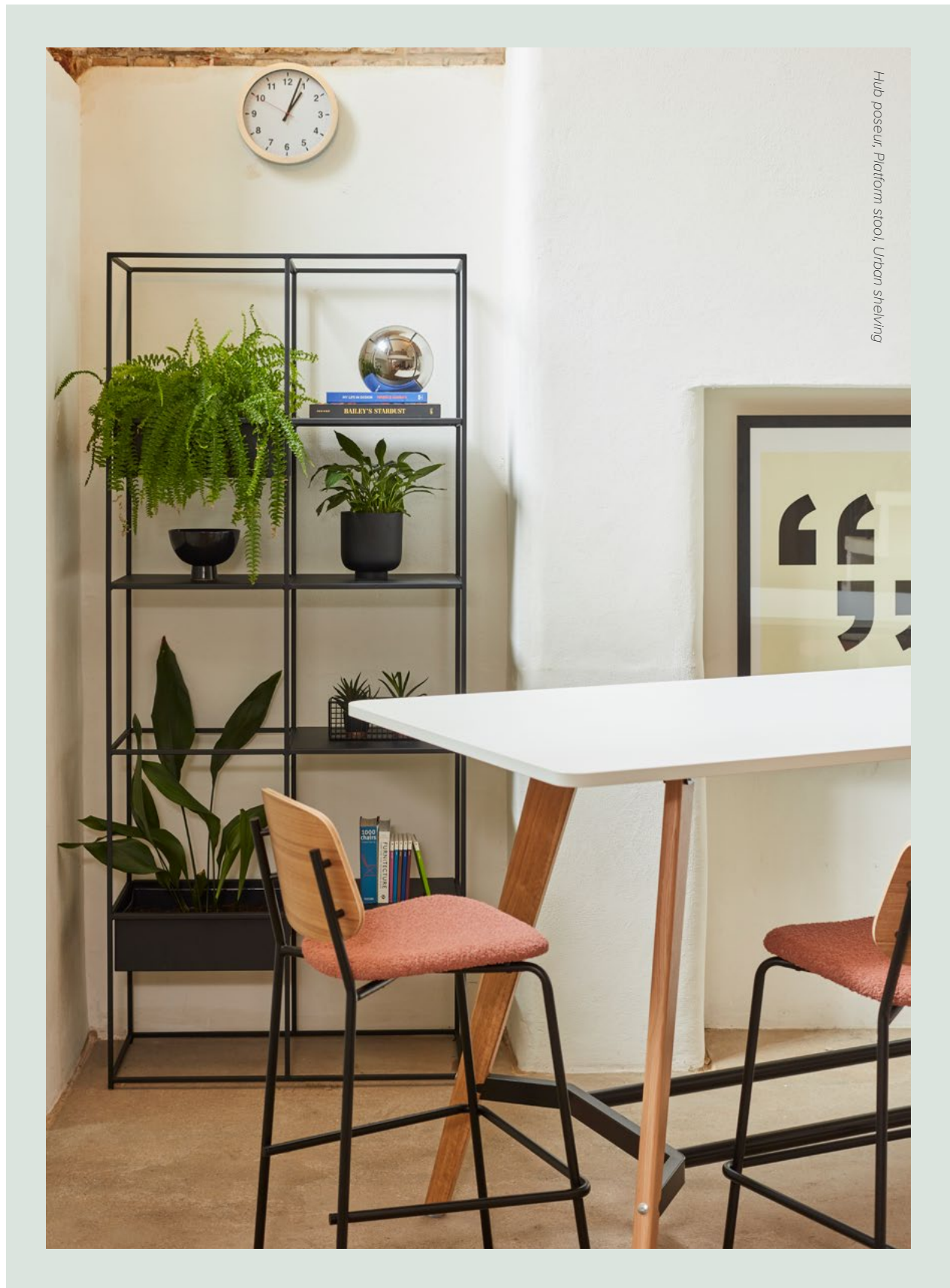
Hub poseur, Platform stool, Urban shelving

Creating a palette of places to work from, collaboration spaces encourage people to be more engaged with their colleagues, while changing postures and moving around throughout the day. Let's get the creativity flowing!