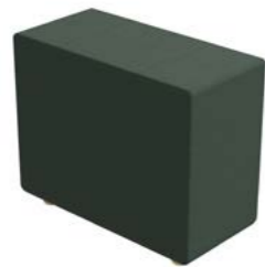
Tall half pouf