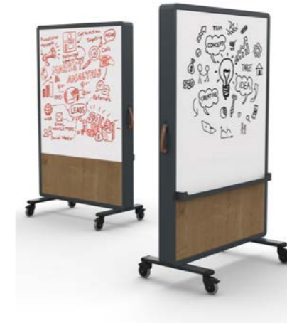
Motion Divider Double whiteboard & MFC bottom