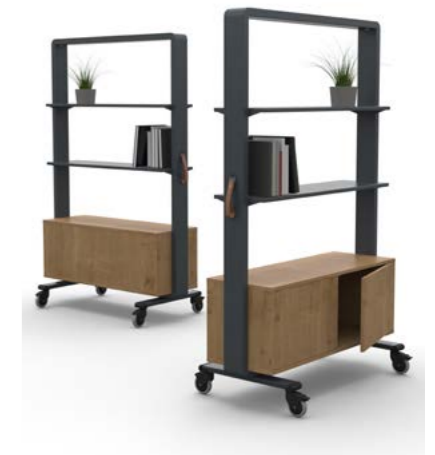
Motion Divider Shelves, incl MFC Storage