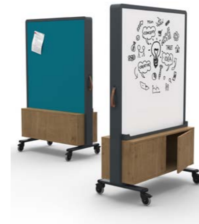
Motion Divider Whiteboard & Pinnable surface, incl MFC Storage