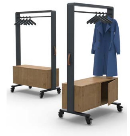
Motion Divider* Coat hanger, incl MFC Storage