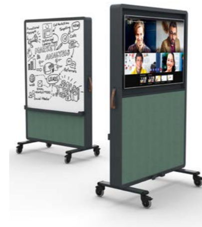
Motion Divider Media unit & whiteboard, incl fabric bottom