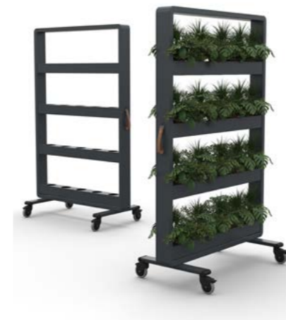
Motion Divider Full length planters