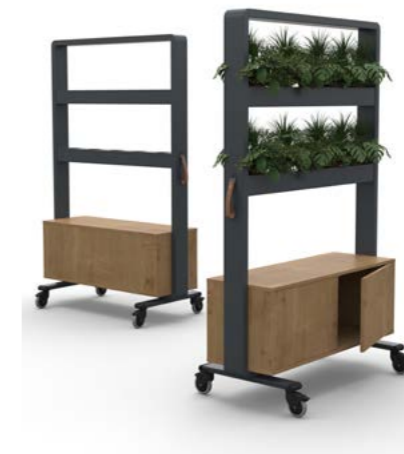
Motion Divider Planters, incl MFC Storage