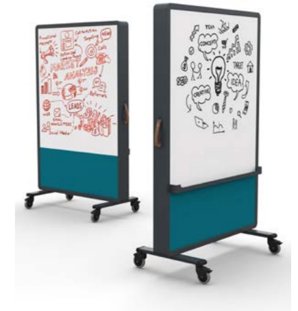
Motion Divider Double whiteboard & fabric bottom