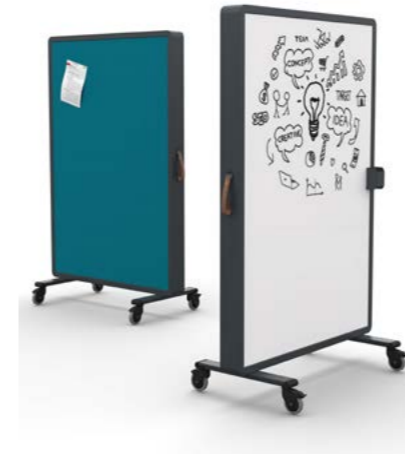
Motion Divider Full length whiteboard & Pinnable surface