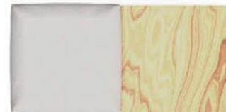
Module telephone pouf