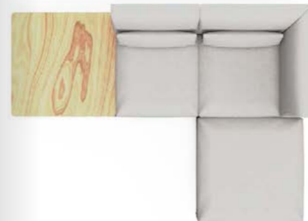
Corner daybed with table (right)