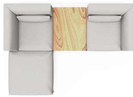
Module double corner with centre table and pouf (left)