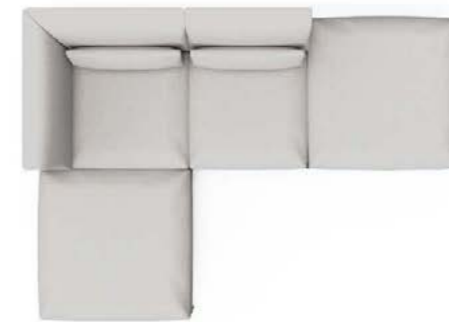
Corner daybed with pouf (left)