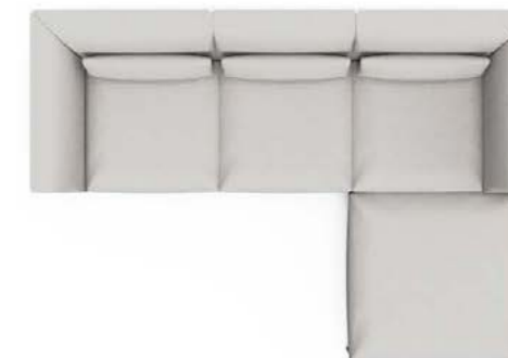
Corner with pouf (right)