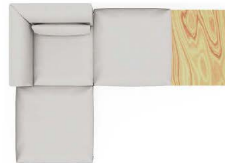
Module 2 seat daybed with pouf and table (left)