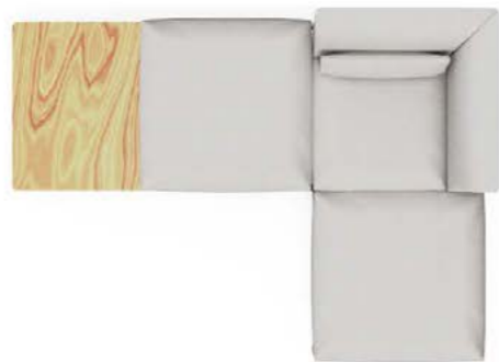
Module 2 seat daybed with pouf and table (right)