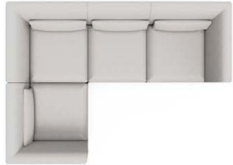
Corner with 1 seat (left)