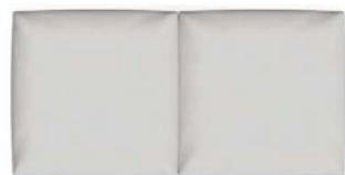
Module double pouf