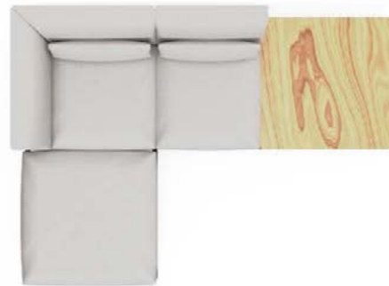
Corner daybed with table (left)