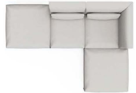
Corner daybed with pouf (right)