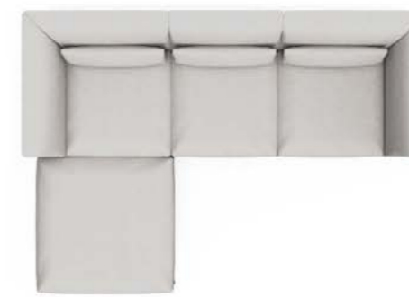
Corner with pouf (left)