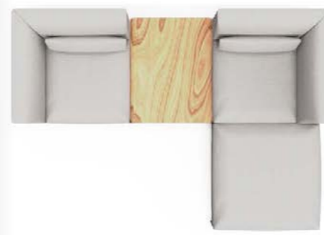
Module double corner with centre table and pouf (right)