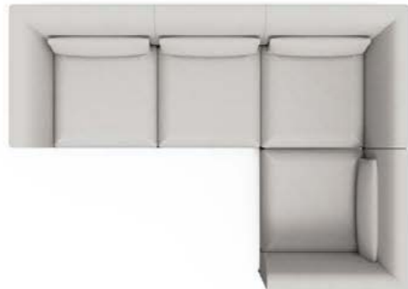
Corner with 1 seat (right)